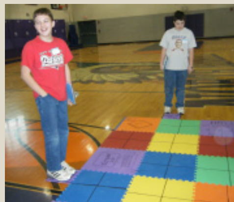
Students at the North Brookfield Youth Center participate in a CAPS activity

or No Deal" is one of the featured lessons; a take-off of the popular TV program, it illustrates probability and risk factors. Another example of the program is "Shoot and Score." During this activity, students shoot basketballs from three different spots to illustrate predictions, averages and odds. The CAPS program is a movement-oriented, hands-on approach to providing the knowledge and skills students need to attain critical thinking skills.