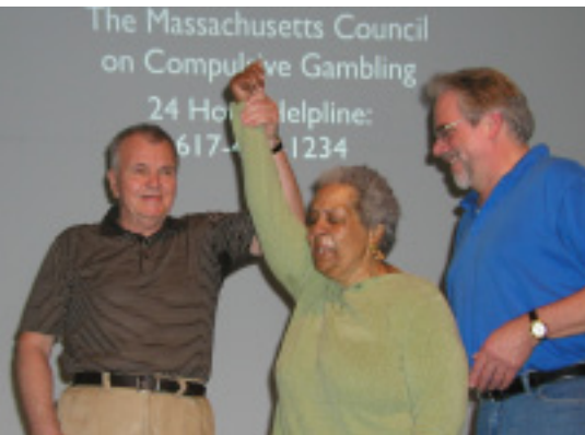
“Bait and Hook” actors received a standing ovation at the Massachusetts Department of Public Health’s Aging with Dignity Conference at Holy Cross in June

The workshop is designed to get older adults thinking and talking about problem gambling. Drawn from concepts of positive aging, participants are asked what is meaningful to them and what they enjoy doing. Time management and leisure activities, including gambling, are discussed. The Council’s goal is not to prevent gambling, but to simply identify the risk factors of problem gambling and provide tips for keeping risk under control and preventing problems. Several senior centers throughout the state scheduled workshops including: Dorchester, Milton, Cambridge, Attleboro, Brookline, and Greenfield.