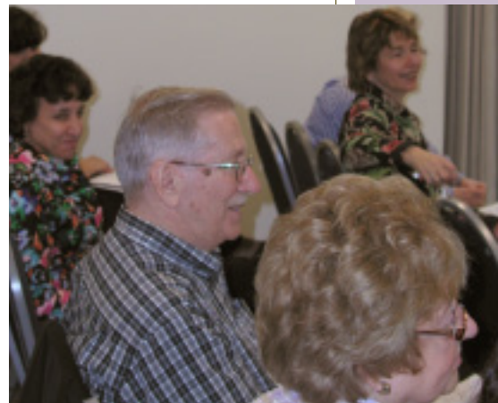
The Council presented "Problem Gambling and Older Adults" during a workshop at the Massachusetts Department of Public Health's Aging with Dignity Conference at Holy Cross in June

The Council provided information and technical assistance to 16 colleges in FY09 including: Anna Maria College, Williams College, and Worcester State College. In addition it distributed 1,500 posters focusing on college age problem gambling to Tufts University for use by their resident assistants and peer leaders, and 600 posters to MIT and Mt. Holyoke for use by their college health educators. In addition, the Council worked with University of Massachusetts, Amherst to integrate gambling prevalence questions in a campus-wide addictions survey. The Council looks forward to sharing the findings as they become available.